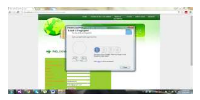
Enroll a Fingerprint